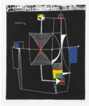
Figure 3: B.C. Binning, Atomic Fountain , 1993, serigraph on paper, ed. 1/100.

Does the title of the artwork provide you with more of an understanding about the artwork? Does the date help place it within a specific time/art period in which it was created? Does the information provided change how you view the artwork?