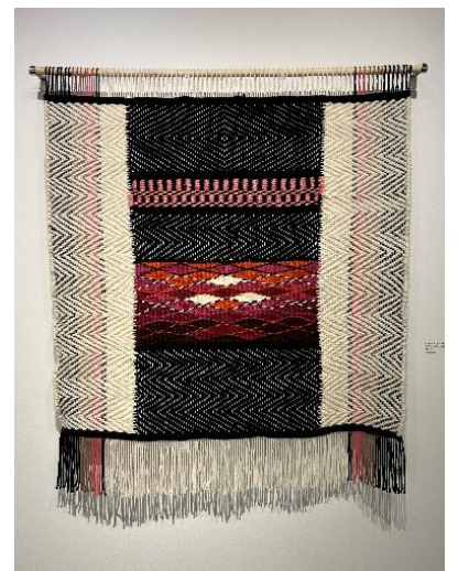
Figure 2: qʷənat, Angela George, Reflections at Sunset , 2024, wool blend.

Imagine the artwork as a feeling. Where in your body does the artwork sit? Is it in your hands, head, stomach, feet? Does it move throughout your body?