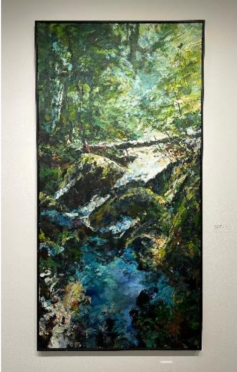
Figure 1: Gordon Smith, Gambier Island Stream , 1991, acrylic on canvas.

Select any artwork and use the following prompts to guide your looking. We've included a few suggested artworks below: