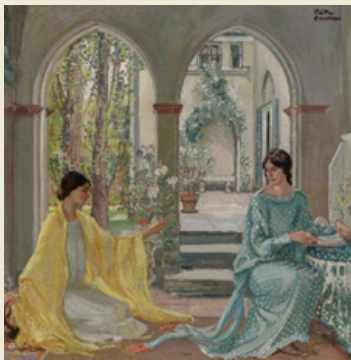
Edith Emerson (American, 1888–1981) A Florentine Garden Oil on canvas