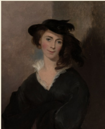
Thomas Sully (Attributed) (American, 1783 – 1872) Head of a Young woman in a Black Feathered Hat Oil on Panel