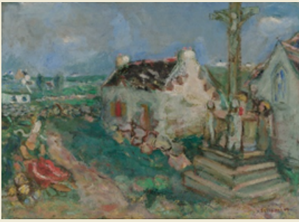
Luigi Setanni (American, 1908–1984) Village and Calvary, c. mid-1930s Oil on canvas